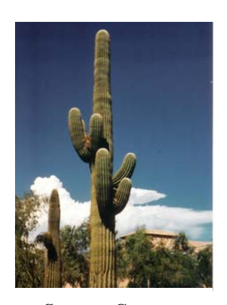
Saguaro Cactus Phoenix. Arizona

The annual meeting American the Academy of Implant Dentistry (AAID) will be held on October 19-23, 2005 at the Westin Kierland Resort and Spa in Scottsdale, Arizona. Several activities of special interest to Diplomates and to those interested in certified